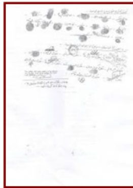
The Mohmandara Peace Agreement

One of the first actions prioritised by the DDA in Mohmandara district was to hold a jirga (meeting) with tribal leaders of a neighbouring Pakistan border community, Pakhtoon Khwa. The aim of this meeting was to create a conducive, secure, and supportive environment for implementation of various development projects in the district. On 19 December 2007, a peace agreement was signed with the tribal leaders of Pakhtoon Khwa. As a